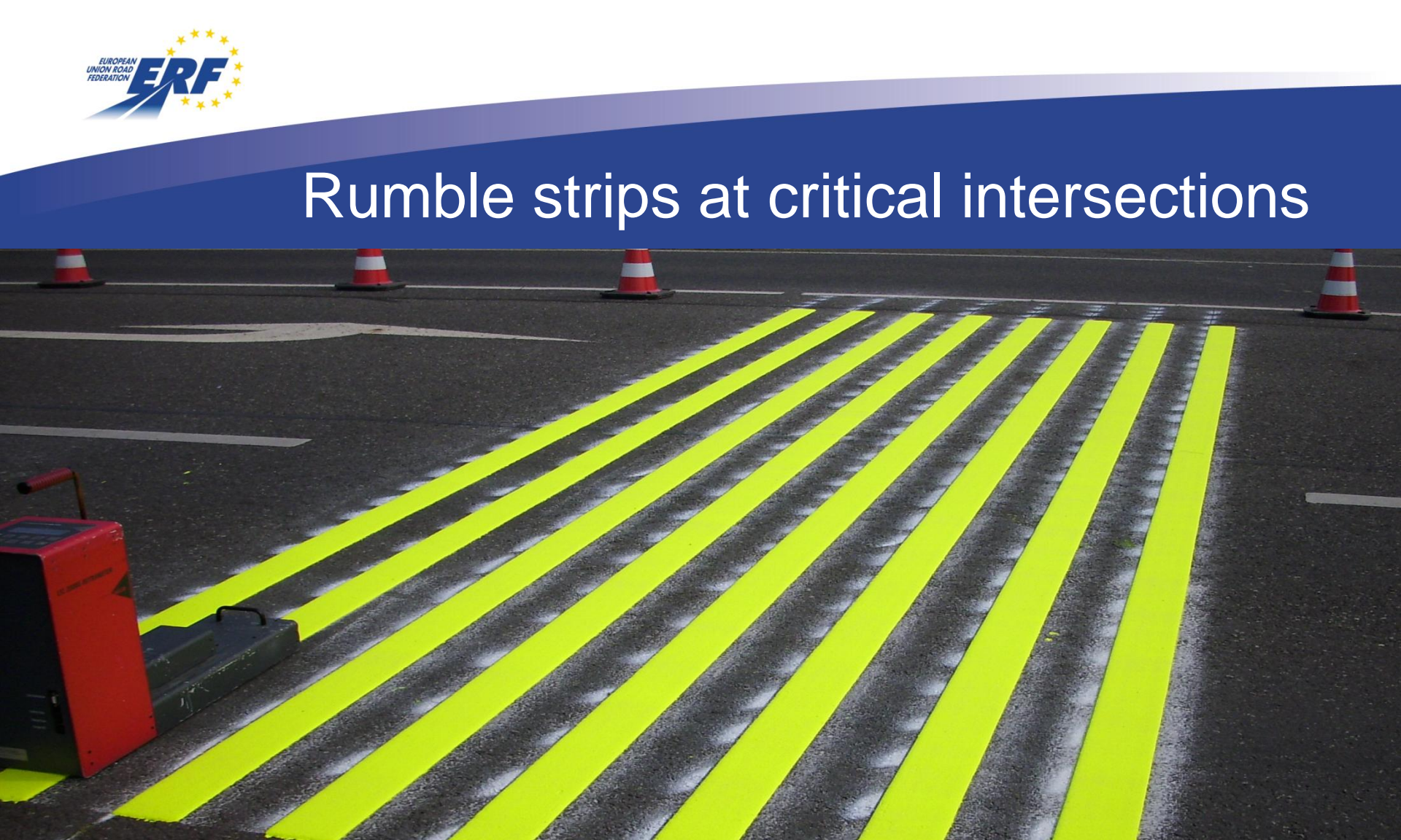
ERF Seminar 22 February 2012