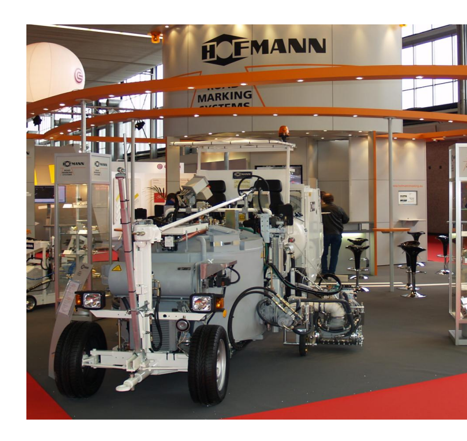
ERF Seminar 22 February 2012